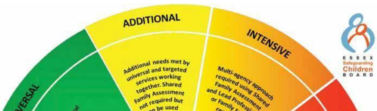
Appendix B: Essex Windscreen of Need and levels of intervention