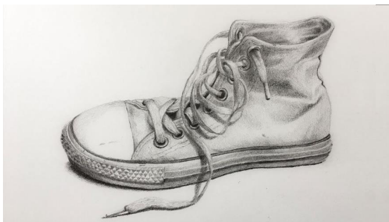
Shoes Grid Drawing

2. SHOES: Find your favourite shoes and set them up to draw from. If you have a printer you could print out a picture of some shoes and make a grid drawing of them. Use any materials that you have.